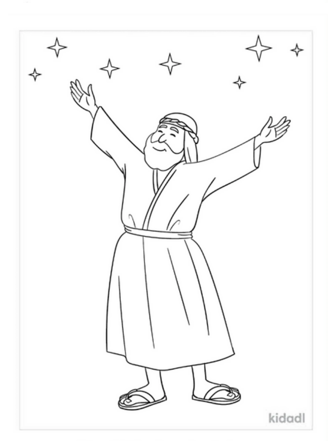
Visit www.kidadl.com for more free coloring pages