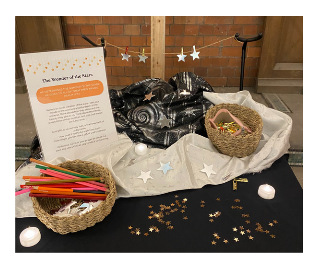
He determines the number of the stars; he gives to all of them their names. Psalm 147.4

Large piece of fabric String Table Clothes pegs Paper or cardboard or foil stars Marker pens