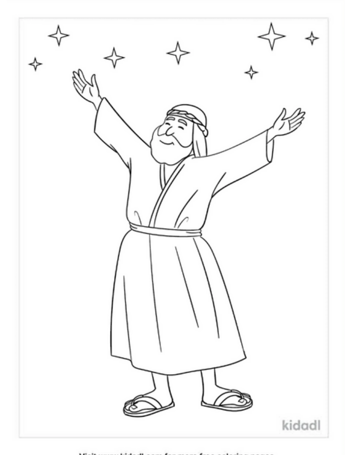
\label{eq:visit} \underline{\text{www.kidadl.com}} \text{ for more free coloring pages}