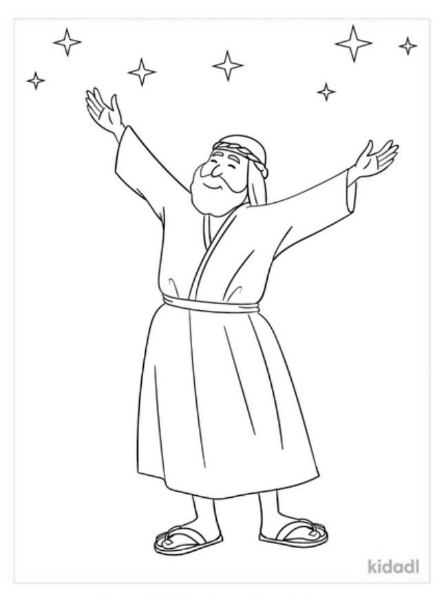
\label{eq:visit} \begin{tabular}{ll} Www.kidadl.com for more free coloring pages \end{tabular}