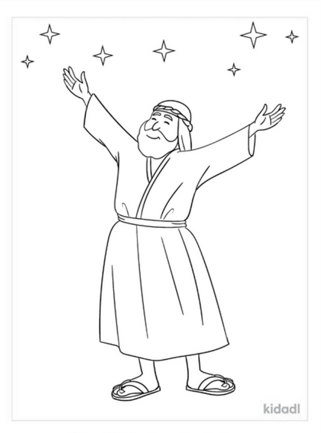
Visit www.kidadl.com for more free coloring pages