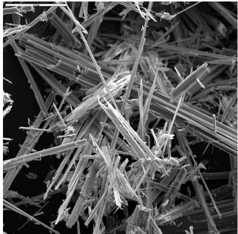
Photo: anthophyllite, a rare form of asbestos, viewed through an electron microscope.

These fibres, when breathed-in in quantity over a prolonged period can cause lung diseases, particularly in people whose lungs are already damaged through smoking.